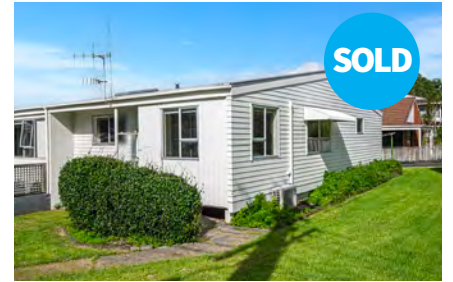
Flat 1/34 Mill Road, Regent Sold June 2025 | $450,000