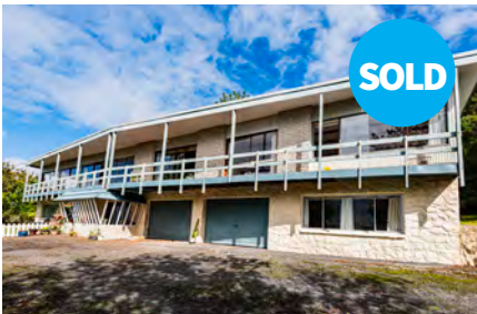
38B Tuatara Drive, Kamo Sold October 2025