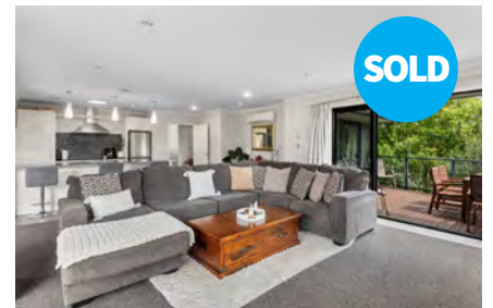
5 North Crest Drive, Onerahi Sold July 2025 | $810,000