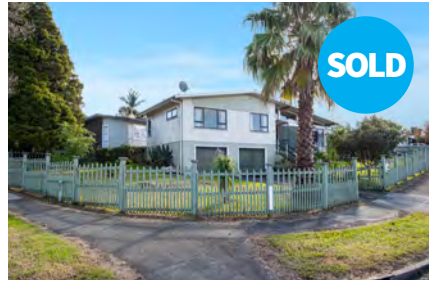
24 Manapouri Street, Tikipunga Sold July 2025 | $510,000