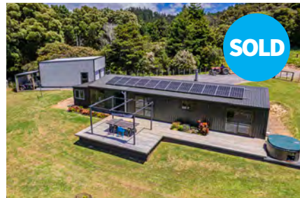
241a Hailes Road, Whananaki Sold August 2025 | $620,000