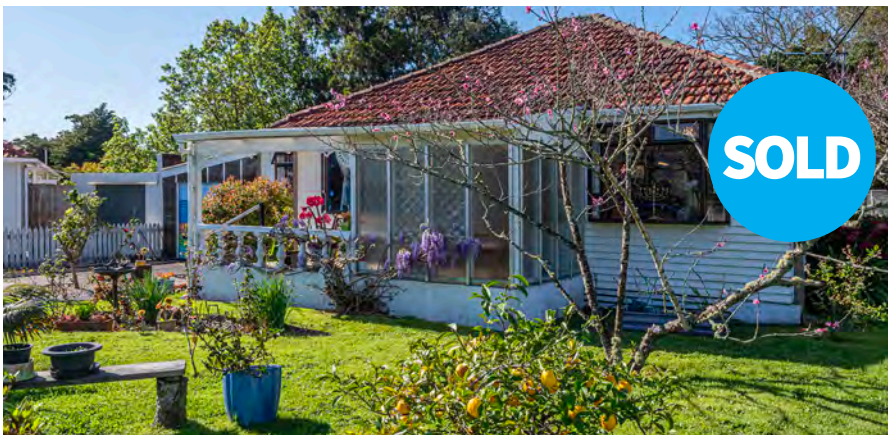
45 First Avenue, Avenues Sold in November 2025