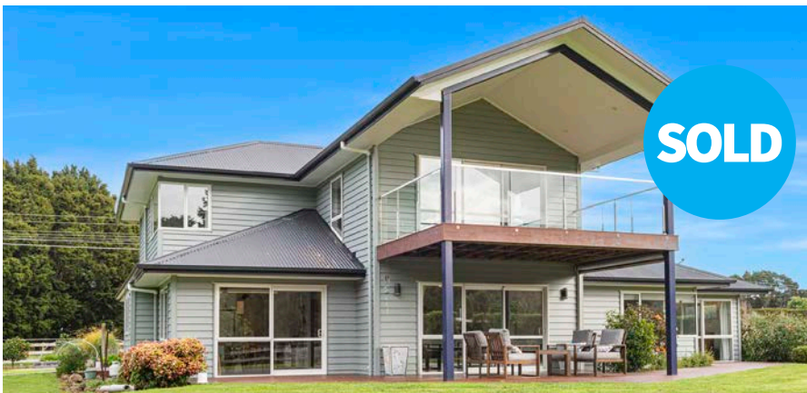
243 Cemetery Road, Maunu