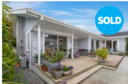
86 West View Crescent, Onerahi