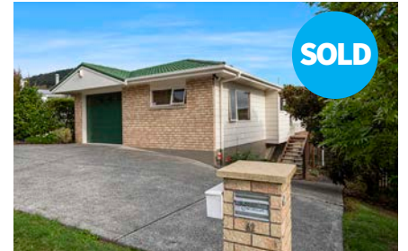
62 Crawford Crescent, Kamo