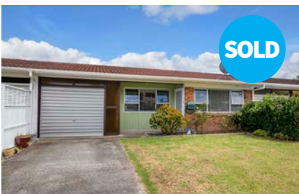
2/5 Brighton Road, Kensington