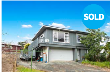
964 Whangarei Heads Road, Parua Bay