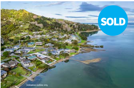
22 Attwood Street, Tamaterau