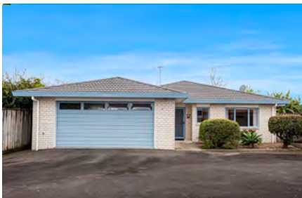
18B Islington Street, Kensington