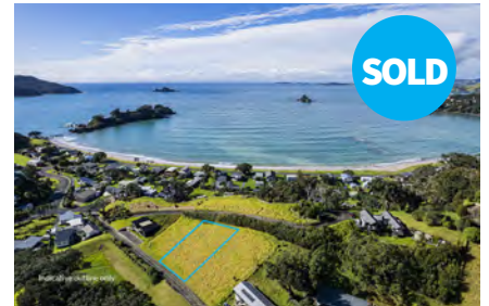
11 Omahu Nui Way, Oakura