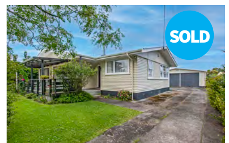
23 Kokich Crescent, Onerahi