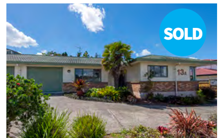
13A Whangarei Heads Road, Onerahi