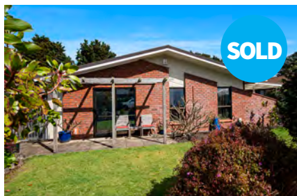
23 Kotare Crescent, Maunu