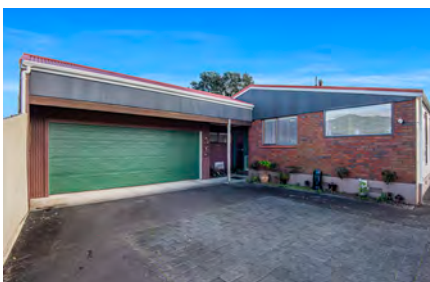
27A Elizabeth Street, Kensington