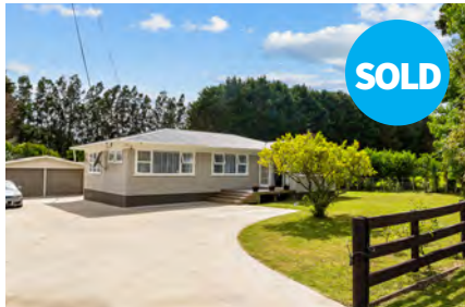
498 Vinegar Hill Road, Kauri